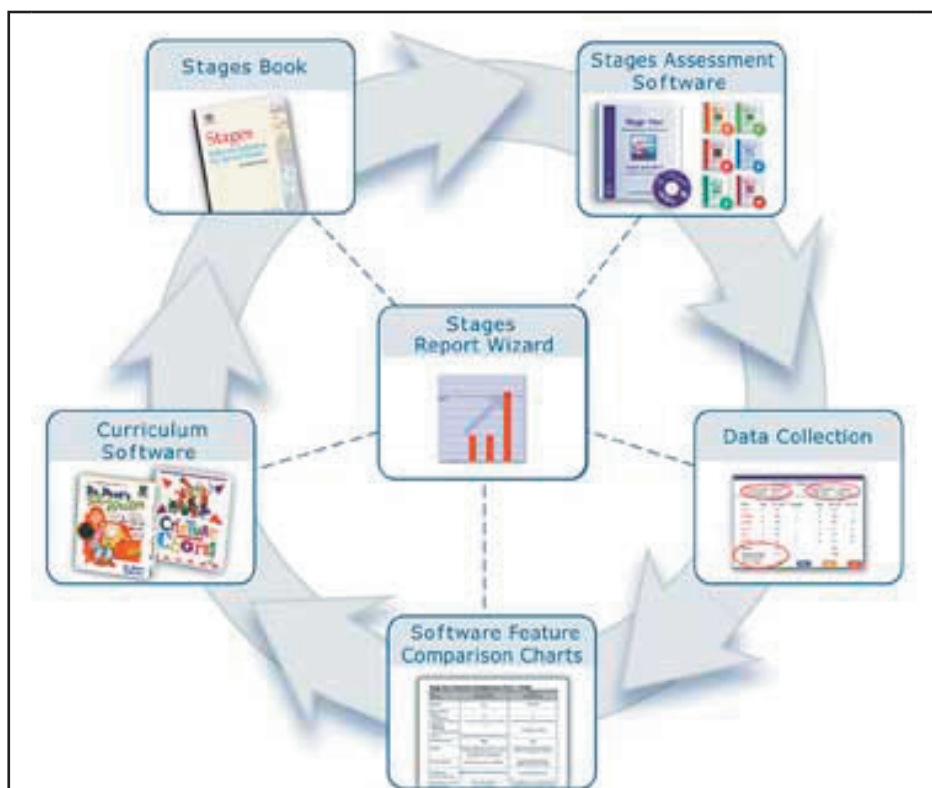
Steps to using the Stages framework